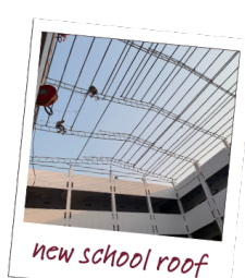
new school roof