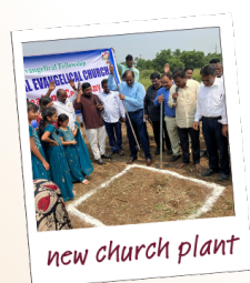
new church plant