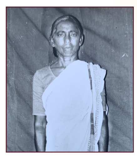
Suvaratnam after she made the decision to follow Christ and serve as an IREF Bible lady.