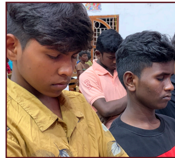
IREF students receive their 2023 Promise Cards and enter the year in prayer.