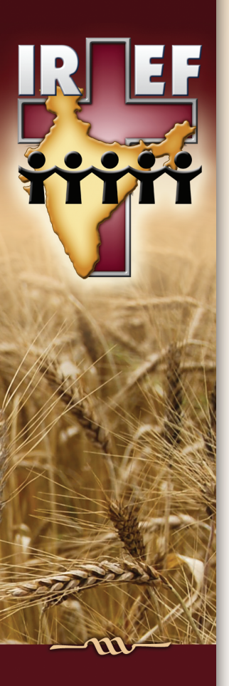
July 2022 continued...