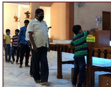
Many expressed their thankfulness and praise to God through their distanced giving.