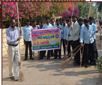
IREF's NSS team sweeps local streets in Rwpalle.

IREF students have taken their participation and role in the NSS as a means to not only serve the community but to also show the love of Christ to those in need. This team of nearly 200 students regularly distributes food and necessities to prisoners and those who are hospitalized; conducts relief efforts in towns effected by natural disasters; and works with municipalities to clean and sanitize local roads.