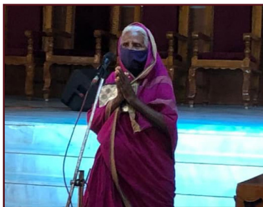
Testimonies of God's provision and faithfulness to His people were shared.