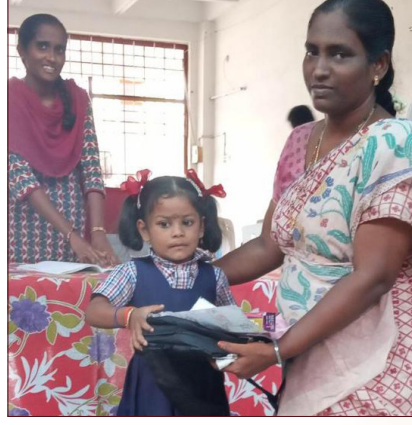
IREF teachers hand out new school supplies, books and uniforms to kick off the 2019-20 school year.

Please pray with us for these young students as they embark on a new academic year and that they would not only learn the way to break the cycle of poverty but find hope in Christ. Child sponsorship is a great to get involved and help these kids have an opportunity for more, all while building a firm foundation of faith. If you're interested in learning more about our sponsorship program, please contact sponsors@irefusa.org.