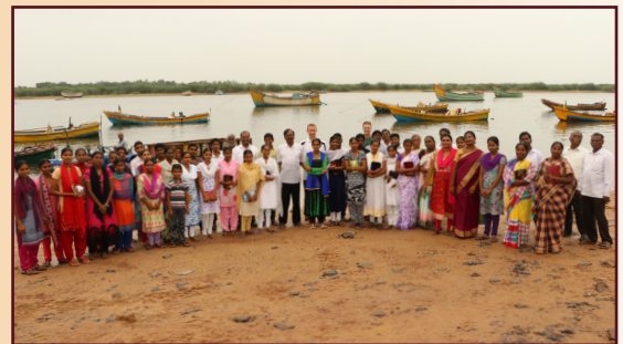
New believers made the commitment of faith through baptism at the end of the Believers' Retreat.