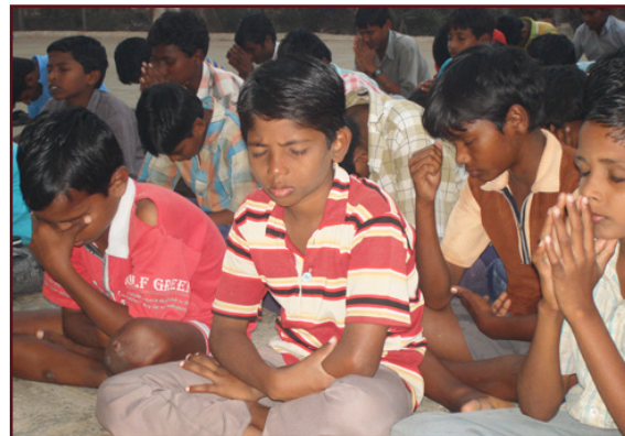
Young boys gathered for prayer before Sunday morning church service at Lydia Children's Home in Repalle.

If you are interested in partnering with a child at IREF, please email us at info@irefusa.org and we will work with you to select a child that you feel led to help.