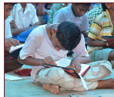
A student takes notes in his bible during devotions before the school day begins.