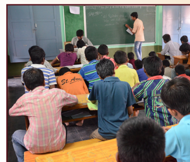
Young eager students learning.