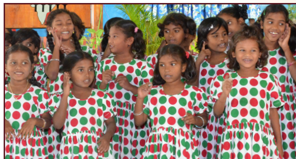
IREF 2nd - 4th grade children sing during Sunday service.

a focus for IREF due to the harmful alternatives for uneducated women in Andhra Pradesh. The IREF Nursing program is dedicated to a 100% graduation rate of its students, who are mostly women. These students are trained in real-life skills, which are taken back to home villages and help in the progression of their communities. With the help of loyal sponsors like you, IREF is achieving its mission to break the cycle of poverty in Andhra Pradesh through Christian education.