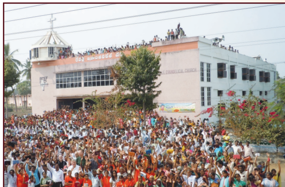
(above) Repalle Evangelical Church - Sunday congregation (right) Eklind Boy's Dormitory