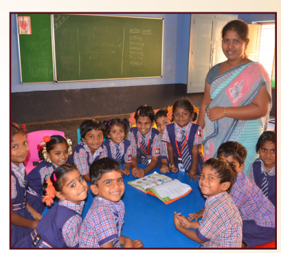
School is back in session for the new 2015-16 academic year.

Students at IREF come from long distances and locally to attend IREF schools. This year many returning students have made the decision to continue their education at IREF due to the quality of education and the Christian principles that are integrated into everyday life at IREF. The 2015-2016 academic year for IREF will include extending its already successful English Medium School to include grades 1st through 7th. Students are given the option to stay on campus in an IREF dormitory or IREF provides a bus service to the local communities to reach children that may not have the resources to accommodate transportation to Repalle. God continues to bless the IREF schools and provide children who would not have an opportunity to be educated a great option to establishing a future. IREF gives priority to the poorest of students during the enrollment time, which can be financially or family-need based. God continues to be gracious to these children and IREF will be obedient to follow God's direction.