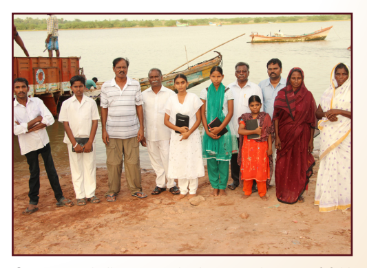
Seven new believers made the committment of faith through baptism at the end of the Believers' Retreat.