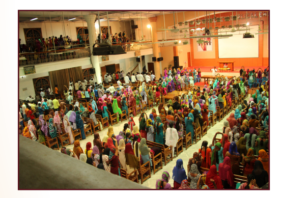
New students and old students pour into the IREF Repalle Evangelical Church to kick off the annual Believers' Retreat.

Please keep the new believers in your prayers as they continue their walk with Christ. Many are often persecuted by family members or even thrown out of their homes/villages for their new faith. Thank you to everyone who prayed diligently for this event to provide hope and IREF is truly grateful for your support.