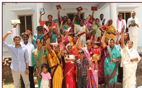
IREF congregations are a source of light in the dark villages.