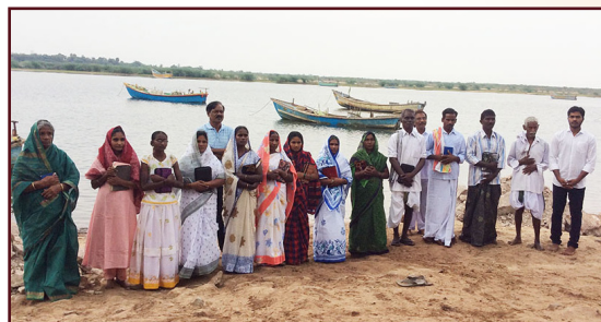
New believers are baptized during the summer village meetings.