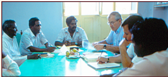
Early leaders of IREF India and IREF USA collaborate in Repalle.