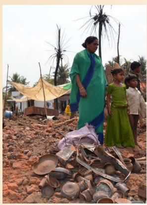
Friend us on Facebook to see more photos of IREF's fire relief efforts.

IREF has been involved in emergency relief in rural villages throughout southeast India for years. Your helping hand to the people on the other side of the world will forever be greatful for your quick response. IREF pastors and staff members helped provide emergency assistance to those in desperate need because of your prayers and support. Hundreds of families now have hope!