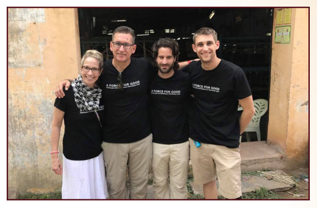
"Bring the whole tithe into the storehouse, so that there may be food in My House, and test Me now in this, says the Lord of hosts, 'if I will not open for you the windows of Heaven and pour out for you a blessing until it overflows.'" – Malachi 3:10.

But, perhaps more than ever before, your partnership is needed to continue the work being undertaken. Together, we can meet the financial obstacles IREF currently faces. By seeking the Lord's will over our finances, and by sharing testimonies of the work being done with those in our networks, we can raise-up a generation of new, committed partners blessed to be able to support the Lord's work in Central India.